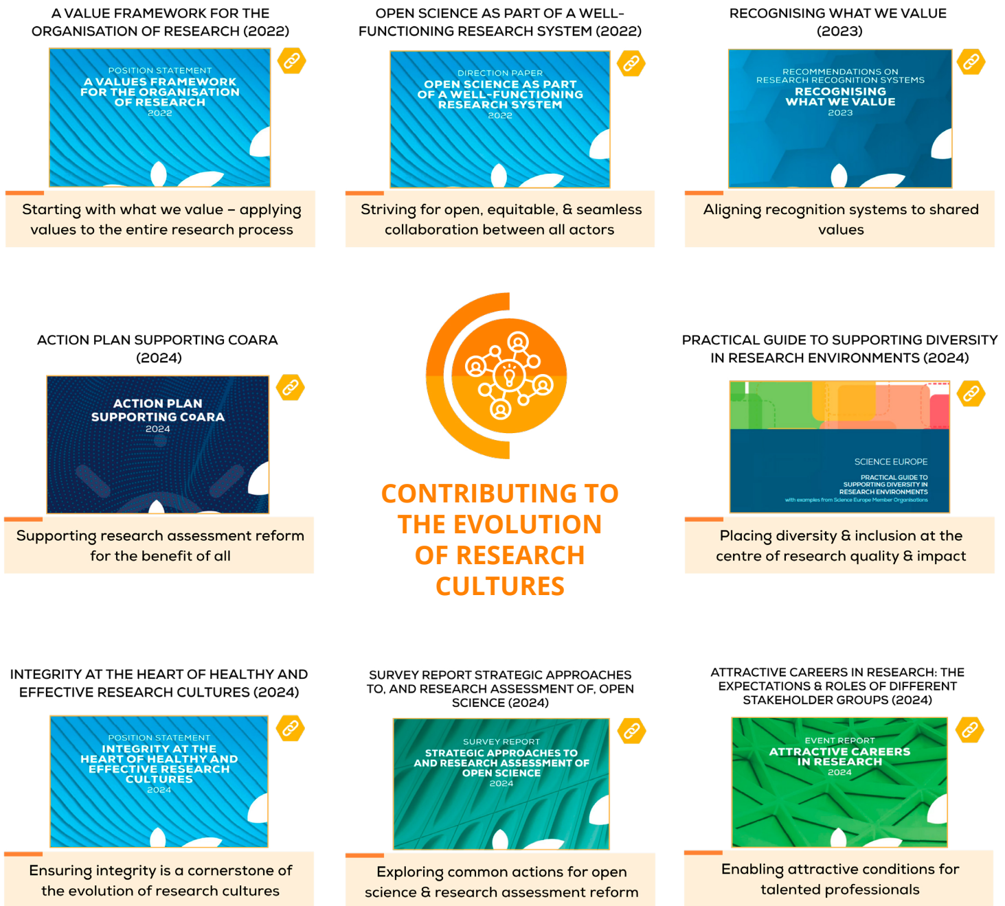
Figure 1 – An overview of the diverse actions Science Europe has conducted in 2021 - 2024 as part of its work towards the strategic priority of ‘contributing to the evolution of research cultures’.